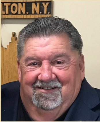
Mayor Joe Lee