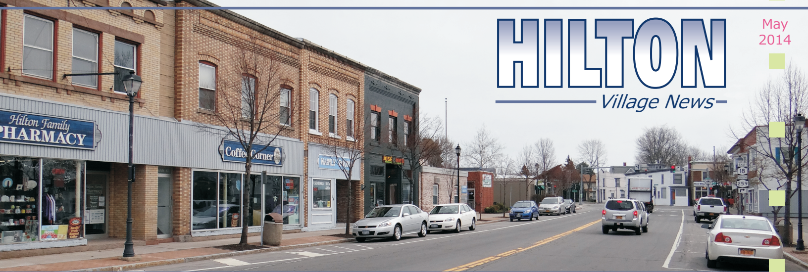
The Little Village with the Big Heart