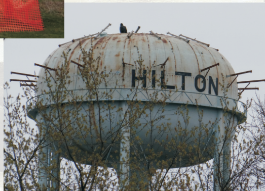
Workers construct scaffolding around the structure.

work could begin. Recently, workers began constructing a scaffolding structure around the perimeter of the tower. The scaffolding will provide a means to encapsulate the entire tower so the exterior can be sand-blasted to remove the old paint, while keeping all the debris contained. Following, two coats of epoxy will be applied with a final coat of polyurethane, providing a smooth, clean, durable surface. The interior of the tower will be undergoing the same type of rehabilitation, using special containment methods to encapsulate all the blast material removed from the inside of the structure. A similar color will be applied to the tower. The new paint is expected to last 20 years with proper maintenance. "Hilton" will be re-painted on the exterior in a larger lettering style, with the new addition of an apple where the "o" belongs. The final phase of the project includes the transfer of the cellular antennae equipment back to the tank and the removal of the portable towers.