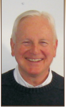
CONTRIBUTED BY DAVE CRUMB VILLAGE HISTORIAN